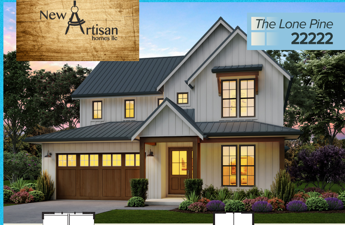
The Lone Pine 22222